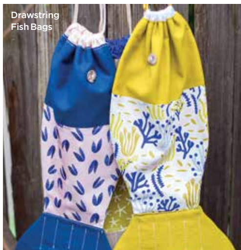
Drawstring Fish Bags