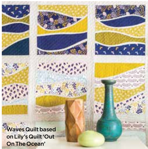
Waves Quilt based on Lily's Quilt 'Out On The Ocean'