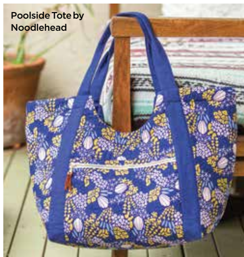
Poolside Tote by Noodlehead